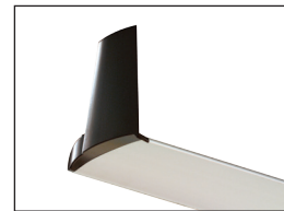
Standard Black Winglet